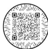
QR code Advent by Candlelight

King Shall Come" We invite all women to join us for an evening together as we prepare our hearts for the Advent of our King! Doors open at 6:30 pm. Program begins at 7pm. Light refreshments will be served. Invite your friends! Please register using the QR code.