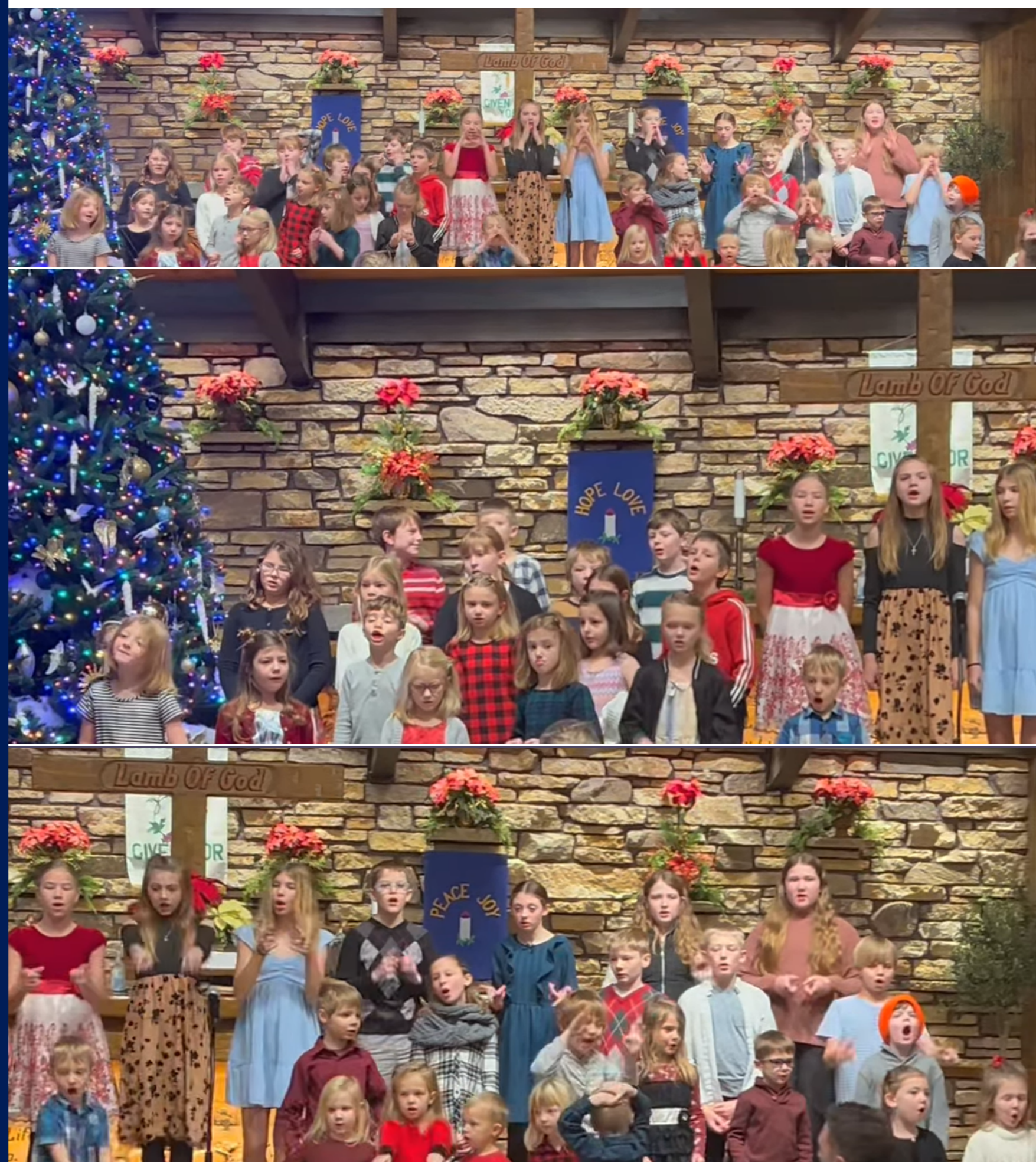
Click on the picture below to watch the video of "Go Tell It On The Mountain"

Just like the angels did to the shepherds, our own children shared the good news of great joy for all the people. Our Savior has been born.